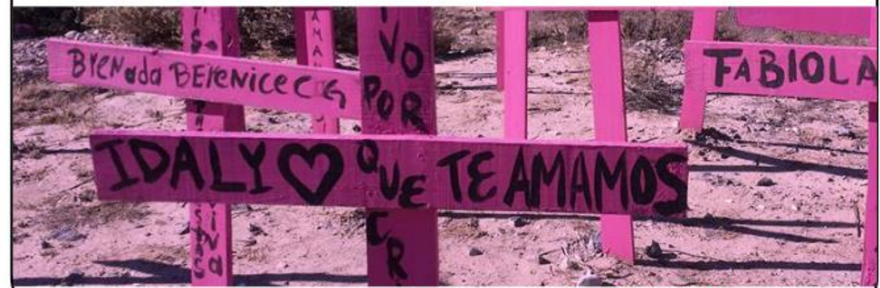
Pink crosses for feminicidios, Mexico