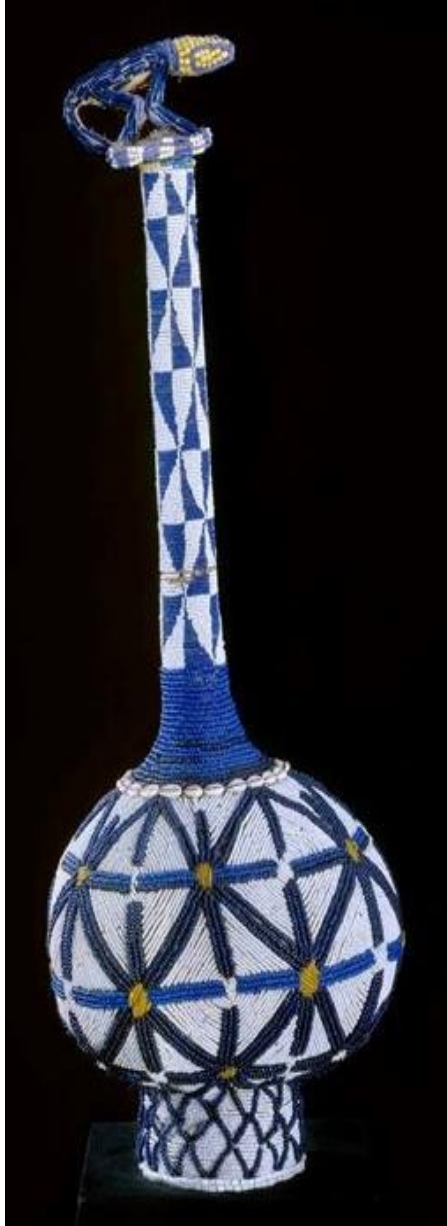
Ceremonial palm wine vessel with glass beads Museum der Kulturen Basel III 23949