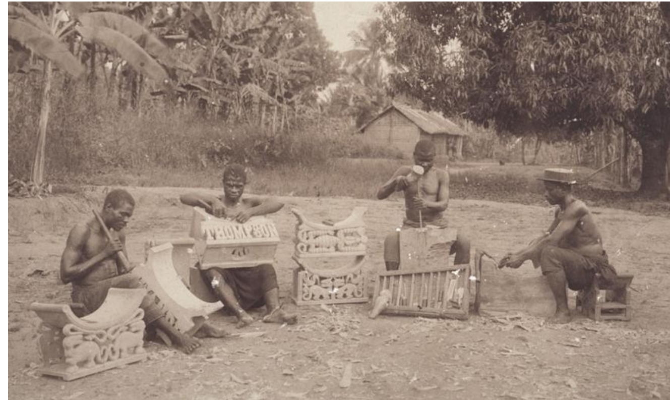
"Chairmaker of Mangamba" BMA E-30.49.012