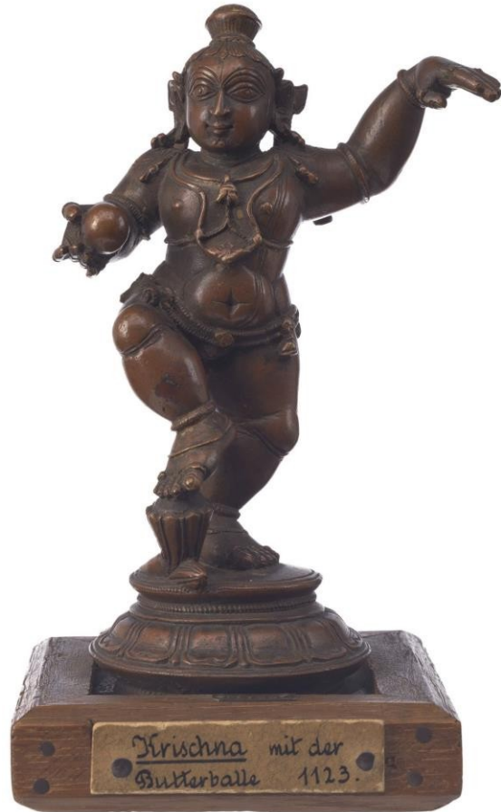
Krishna figure by Kaundinya in the Mission Collection, Museum der Kulturen Basel Ila 9250