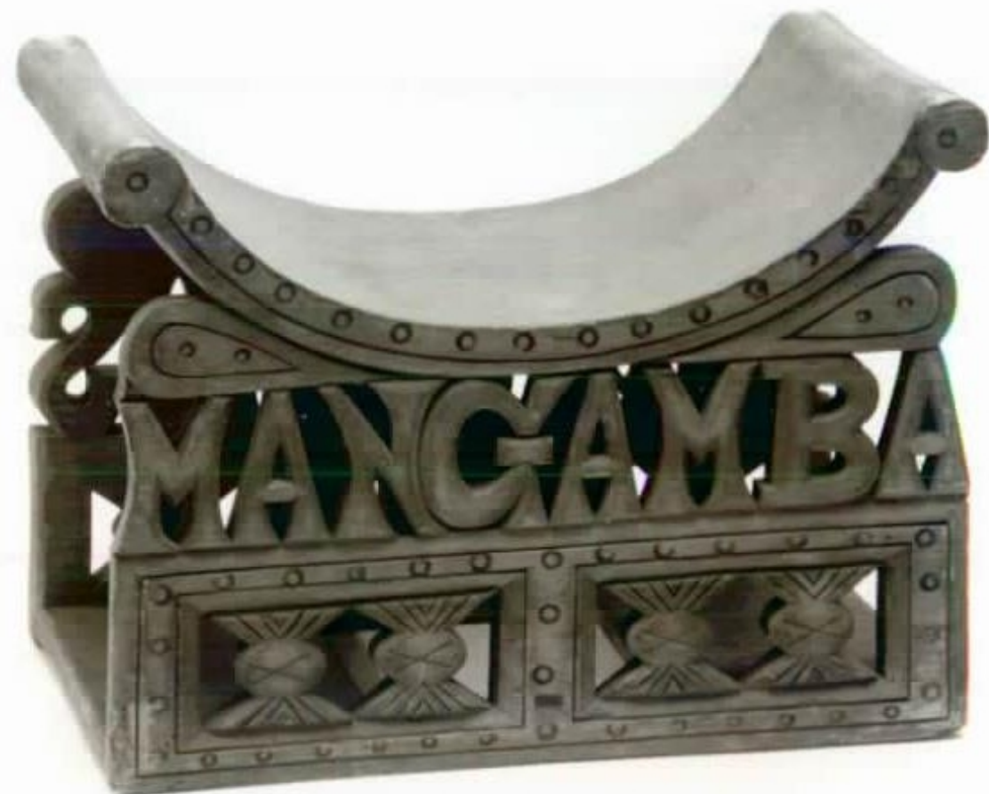
Chair from Mangamba, MKB III 23009