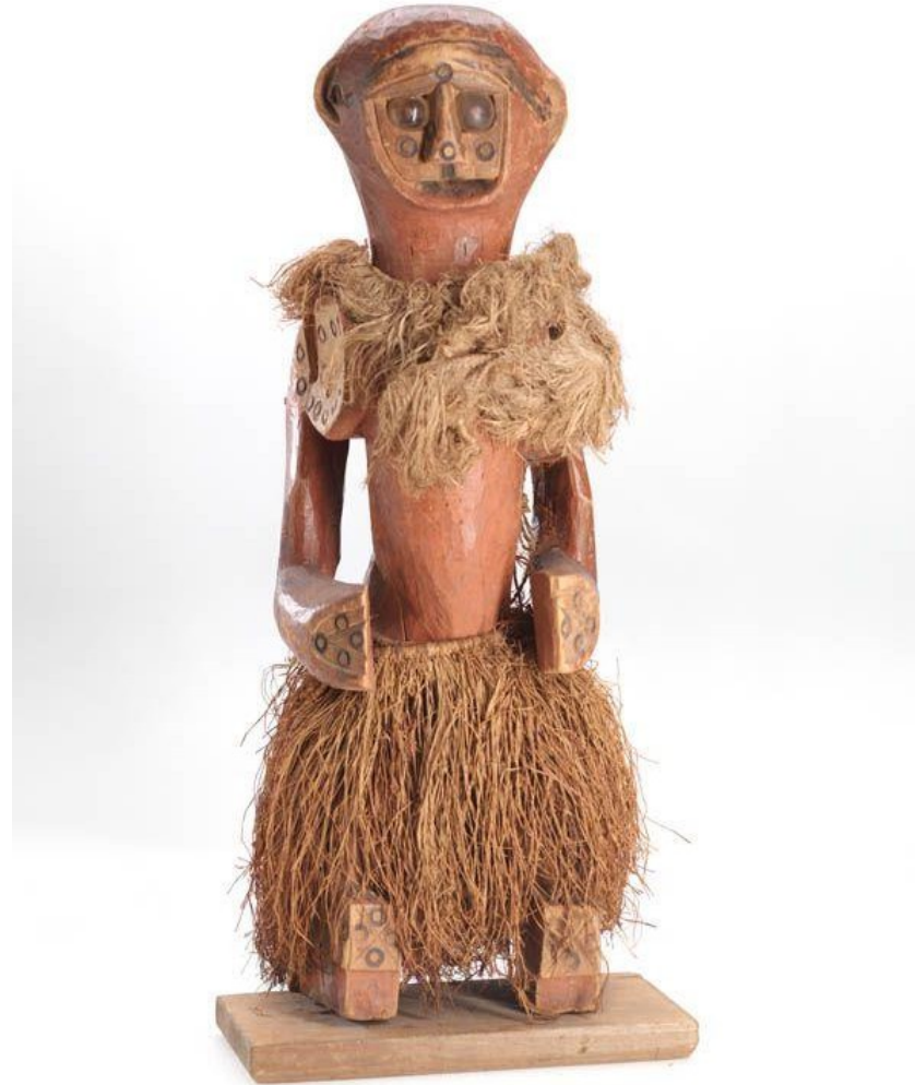
Museum of Cultures Basel III 23939, Photo: Derek Li Wan Po

Power figure from Littoral, Cameroon; stolen by missionary Jakob Keller (1862-1947) as a result of the disempowerment of the men's unions