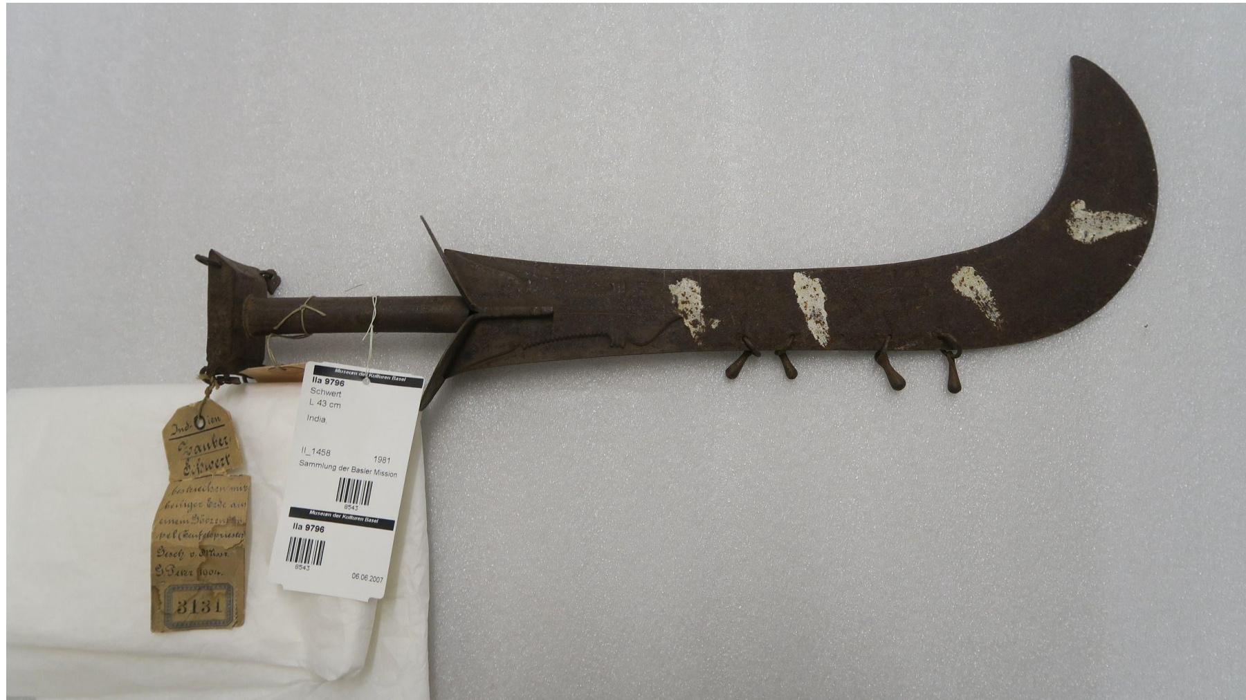
Museum of Cultures Basel, Ila 9798