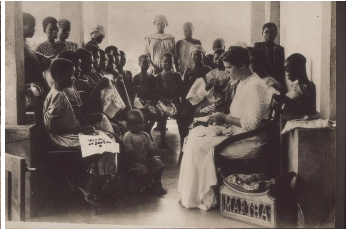
"Martha" chair BMA Q-30.39.004