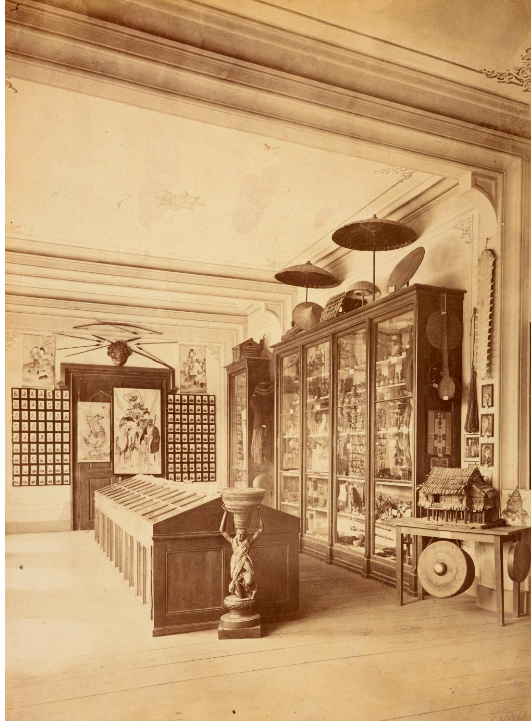
View of the Basel Mission collection in the Mission House from 1860 onwards Fig. Staatsarchiv Basel